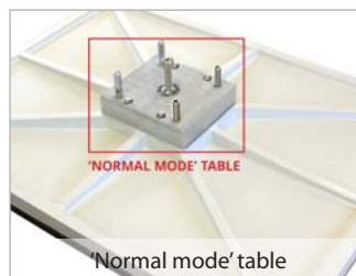
'Normal mode' table