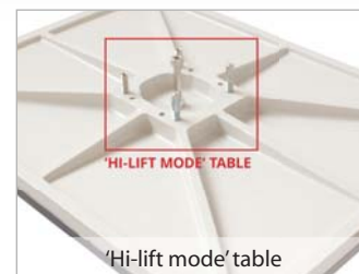
'Hi-lift mode' table